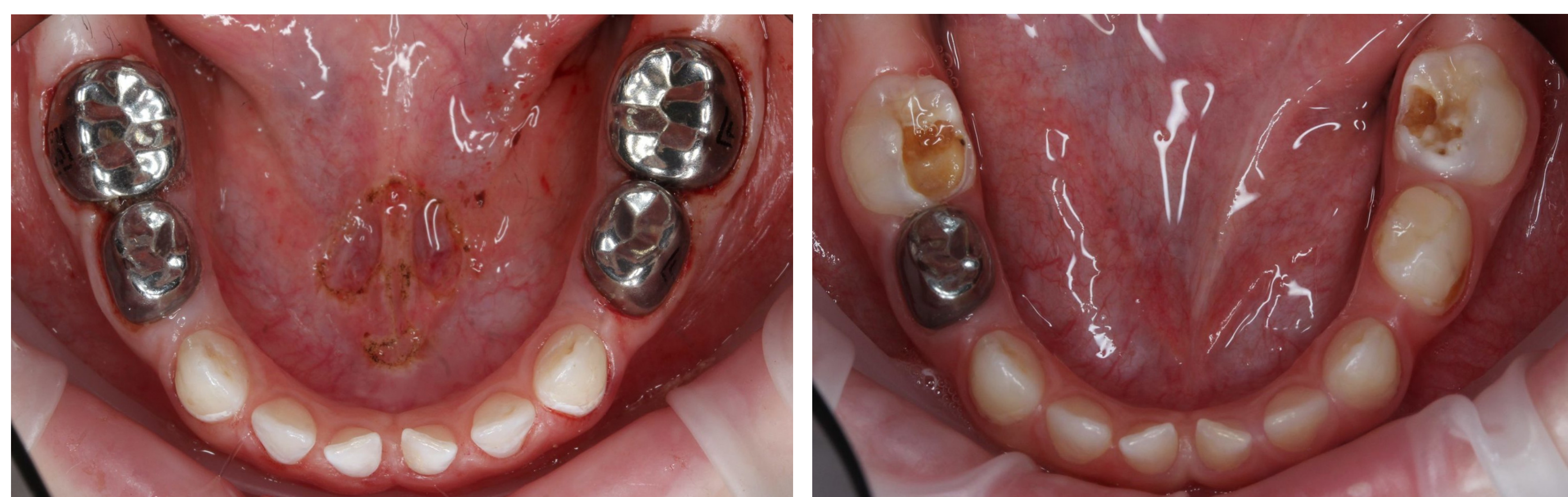
Stainless steel crowns