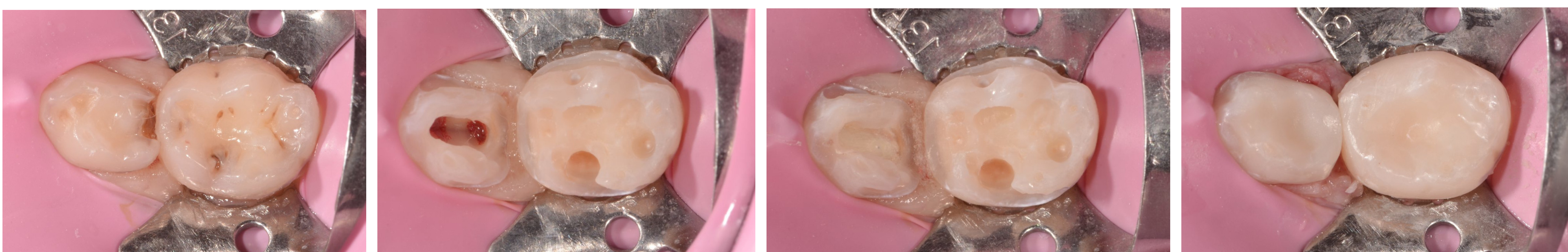
Management of reversible pulpitis by pulpotomy