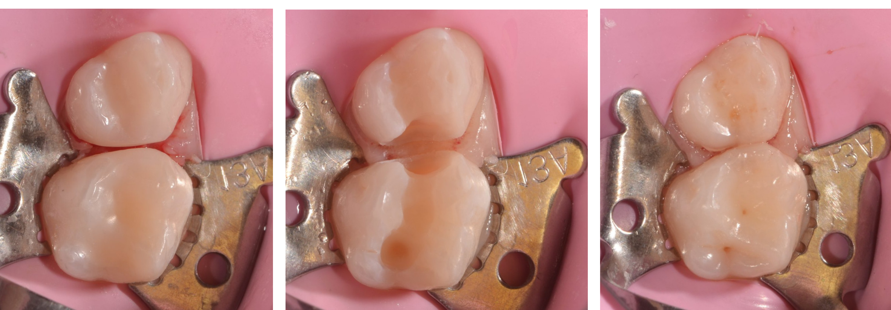
Management of caries in primary teeth