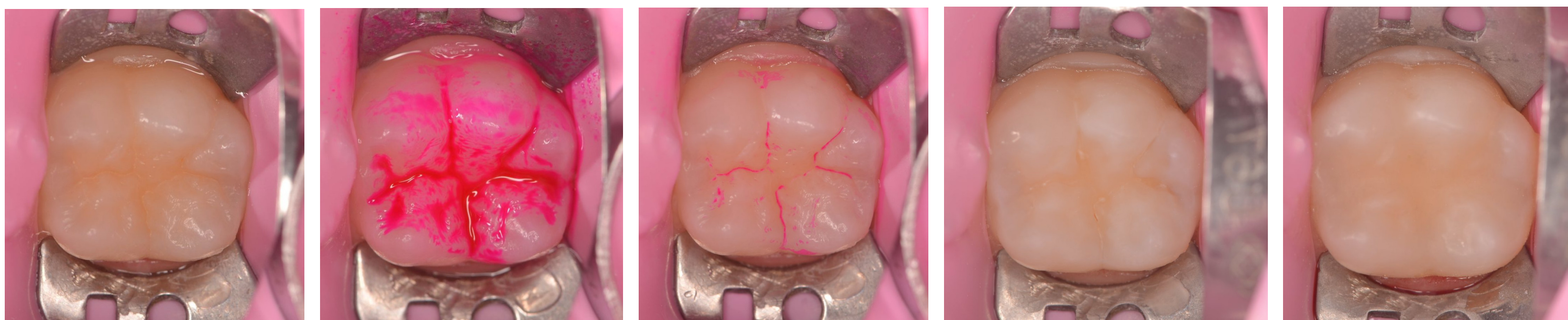
Invasive fissure sealing of the first permanent molars