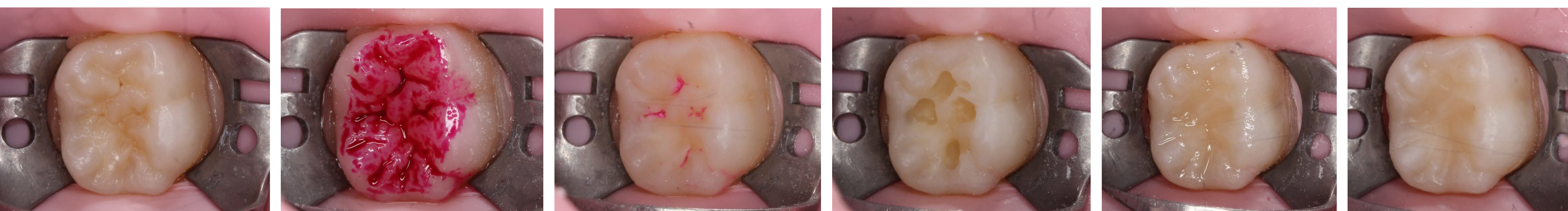
Management of caries in permanent teeth