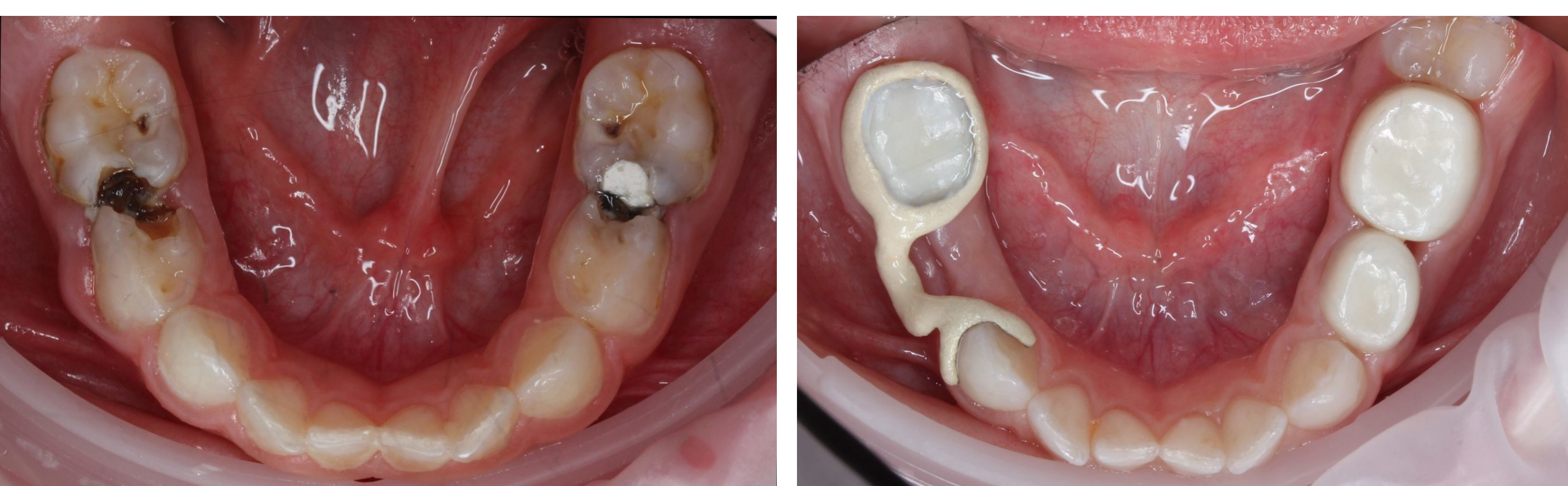
Restoration of teeth with aesthetic zirconia crowns