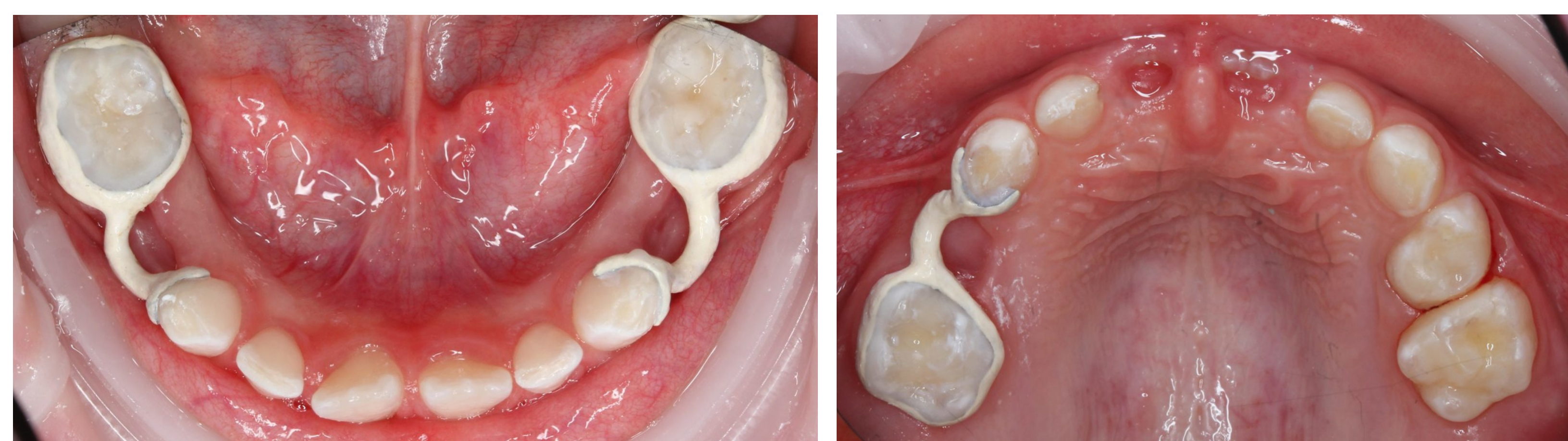
Placement of space maintainers after premature loss of primary teeth