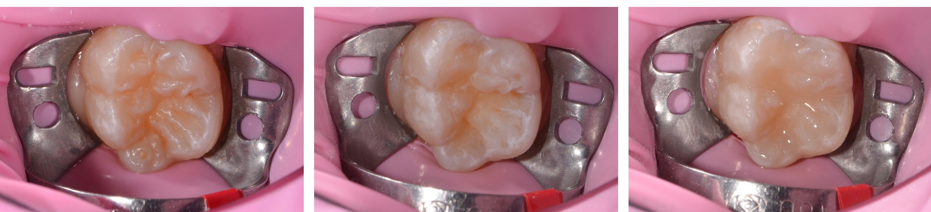
Invasive fissure sealing of the first permanent molars