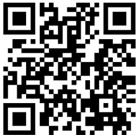
SCAN FOR MORE DETAILS

I hereby affirm that all information and references furnished here with are all true and correct